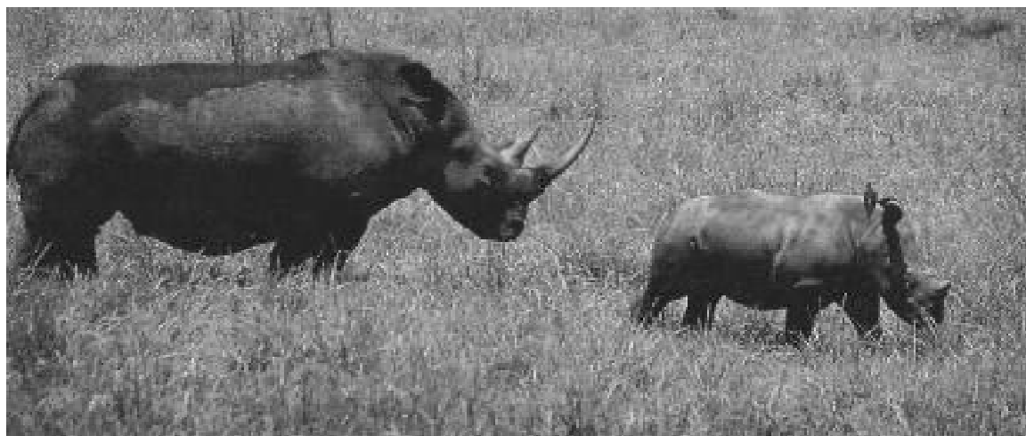
A female northern white rhinoceros with her calf, Garamba National Park, Zaire.