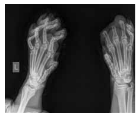
Fig. 2. X-rays taken in March 2016, showing loss of phalanxes on three of the toes on the right front paw of male leopard Leo80M.