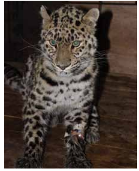
Fig. 1. Female leopard, day after capture appeared disoriented and showed almost no reaction to the presence of people.