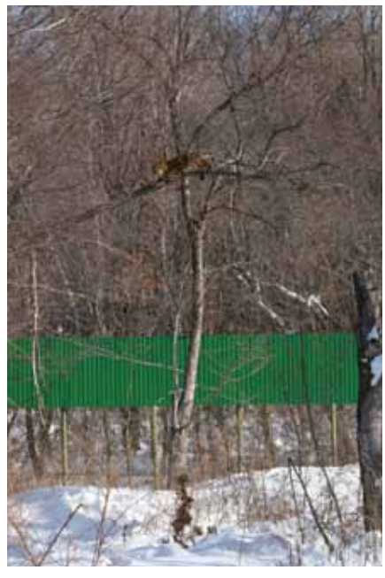
Fig. 4. Leo80M demonstrating his ability to climb trees within the enclosure despite the loss of three phalanges on his right front paw.