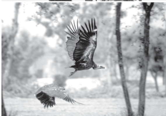
From top to bottom: Three Slender-billed Vultures, Gyps tenuirostris and one juvenile Griffon Vulture, Gyps fulvus (Photo by Rishad Naoroji, courtesy of the Peregrine Fund).