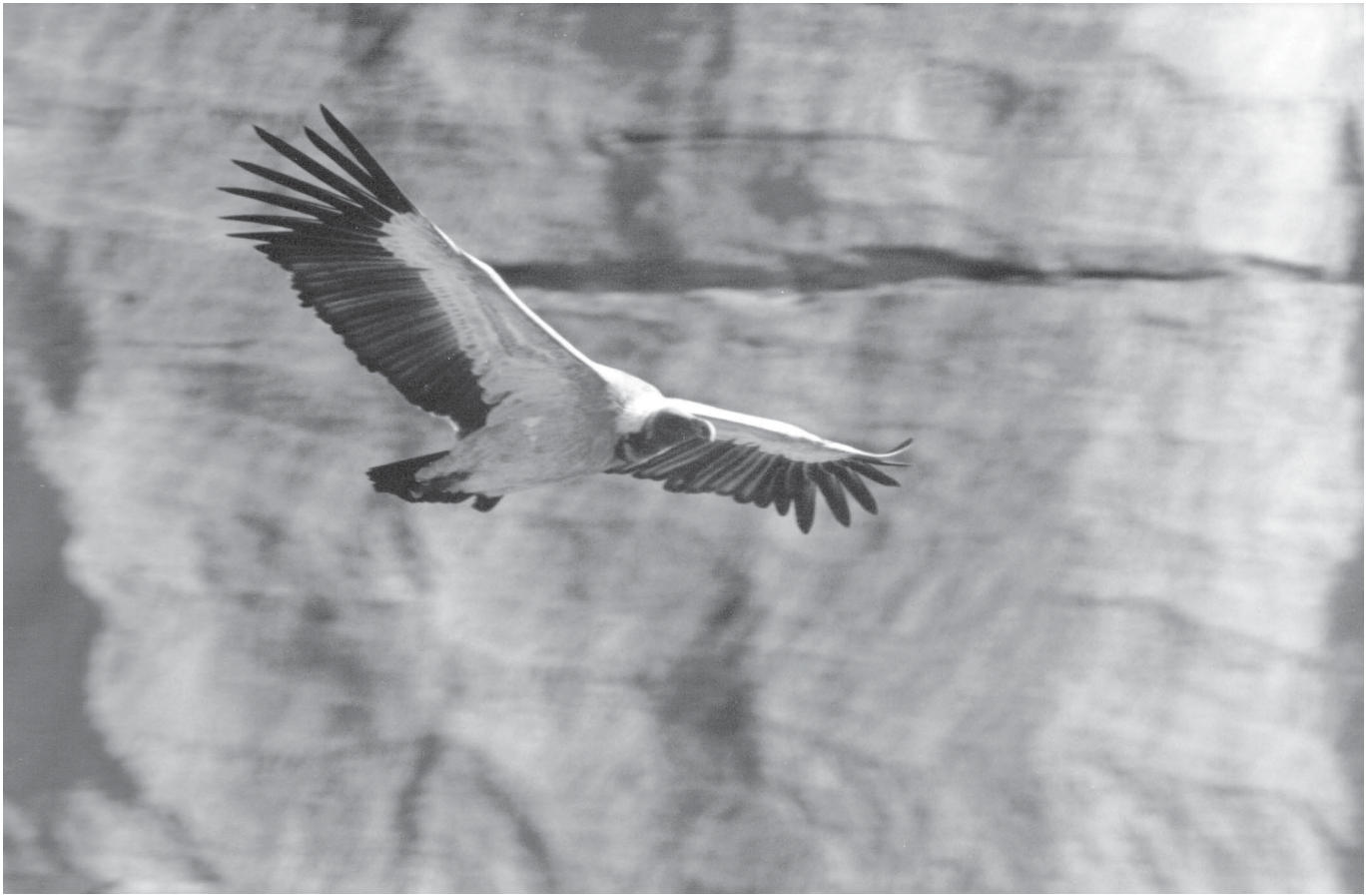
Figure 5. Long-billed Vulture ( Gyps indicus ) in flight.

may be taken over by other animals, such as feral dogs, cats, and rats that, at higher density, may create a new threat to humans from attack and diseases such as rabies and plague. Vultures have been widely used in south Asia as a natural carcass disposal method and must now be replaced with more costly and labor intensive disposal methods. Vultures have also been an integral part of the Parsi (Zoroastrian) "sky burial" that has been devastated by the loss of vultures, especially in Mumbai and Karachi, and vultures have an important part in Hindu mythology.