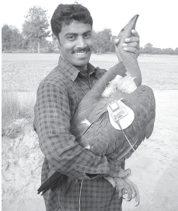
Exhibiting a tagged bird.

residue contamination, and that the most (only?) likely source of such contamination is from treated livestock carcasses. This line of argument has since been bolstered with results (in press) from India that demonstrate the same 100% correlation between renal failure and diclofenac residues, and ~85% mortality due to renal failure, from many more sites in India and Nepal (Boelsterli 2003). Sales figures for diclofenac from the late 1990's indicate sales in the $600